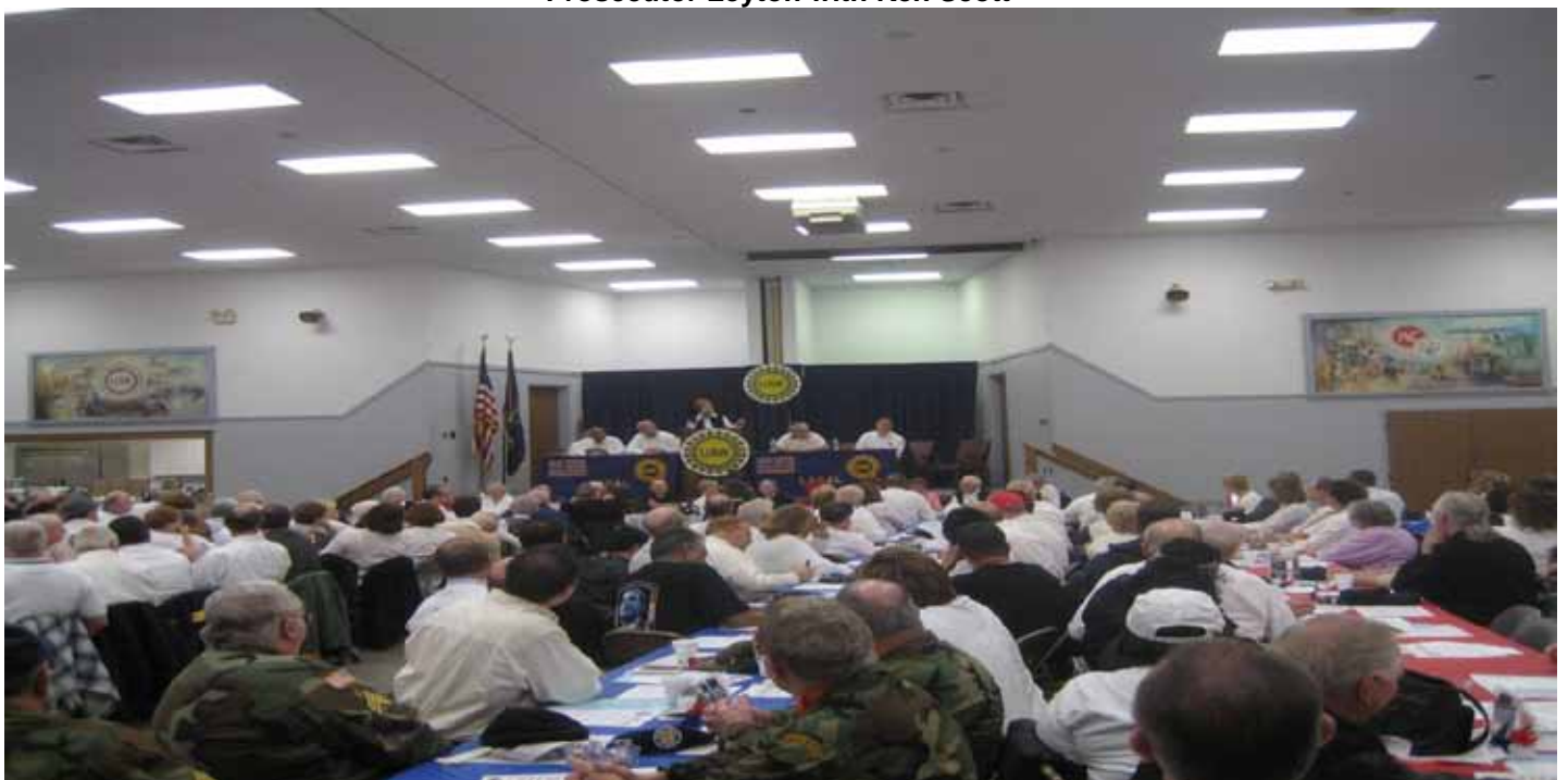
White Shirt Day ceremonies always draw a large crowd of proud UAW members.