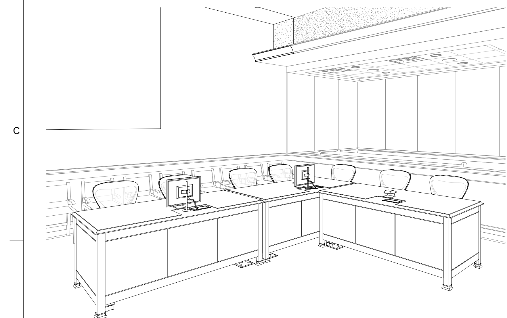
3 PERSPECTIVE - NEW TABLE SCREEN FOR VISUALIZATION ONLY. NOT FOR CONSTRUCTION