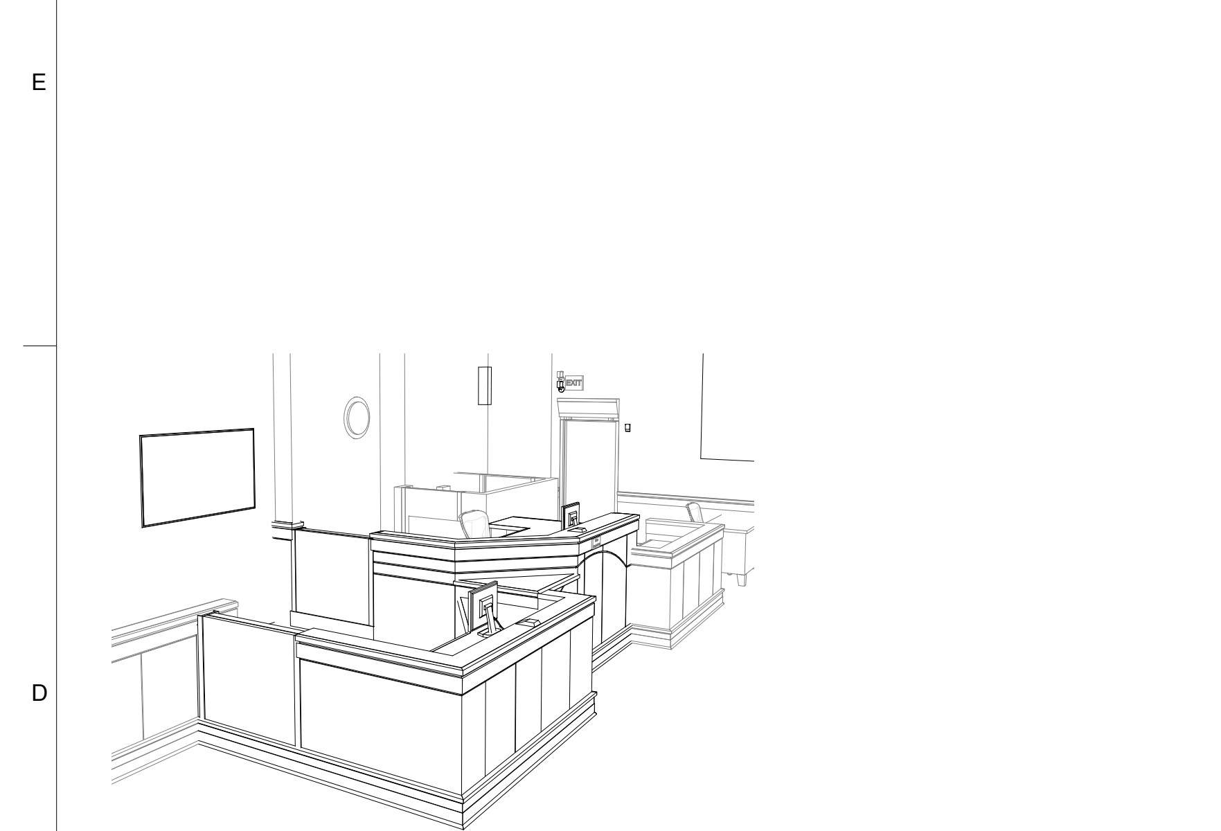
2 PERSPECTIVE - NEW JUDGE BENCH FOR VISUALIZATION ONLY. NOT FOR CONSTRUCTION